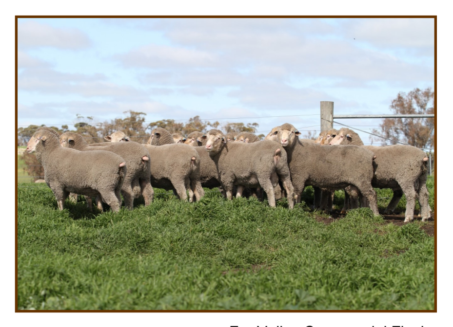
Far Valley Commercial Flock

Visit us on our Website for more information:-